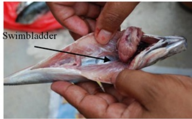
Fig. 3: Swim bladder observation

Reference [14] and [16] have mentioned density ( \text{kg/m}^3 ) and speed (m/s) of w , fb , and sb . Frequency 38 kHz is used. Density of fish body and swim bladder has been determined by ratio between weight per kg and volume per \text{m}^3 . Density of water, fish body, swim bladder and speed in the water used to calculate for sound speed in the fish body and swim bladder.