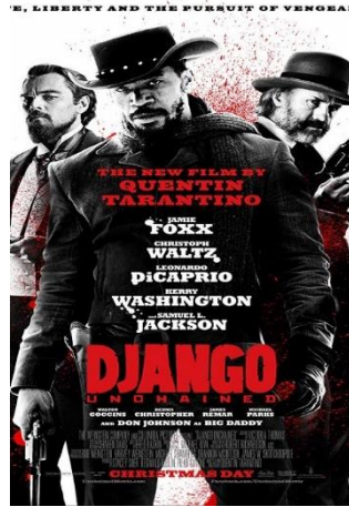
Image 1. Poster of Django Unchained Movie

Django Unchained is one of the films with a background in slavery in America, genres was drama western. Filming locations in Jackson Hole, Wyoming, USA. Related date in 2012, Country of origin USA, the movie was written and directed by Quentin Tarantino.