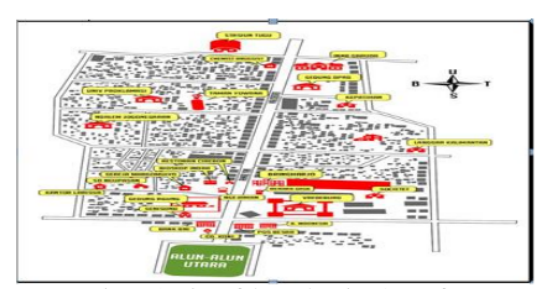
Figure 1: Plan of the Pedestrian Area of Malioboro Street

Nowadays, after 248 years, Malioboro street is very crowded and busy because there are many street vendors, artists, tourists and locals shopping and enjoying the city. They walk, sit and watch angklung art performances, culinary hunting or doing cultural and historical tours.