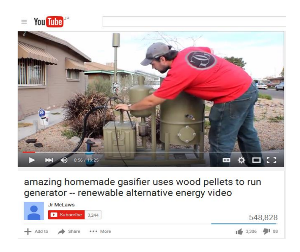
Figure 3. Typical YouTube video with the views count and like-dislike expression

Nevertheless, such an informative and communicative video was not necessarily created in a well-equipped studio where every single detail of the recording process is professionally well-prepared. As the engagement performance, the video was viewed more than 900,000 times and attracted more than 900 comments (as of May, 2018). Some of the comments contained technical discussions, suggestions related with the know-how, criticism on the selection of technology, as well as appreciation for creating and sharing the video including the detail explanation. The video and question or comment in the comment list has both a thumb up (meaning of I like this) and a thumb down (meaning I dislike this) signs adjacent to Reply sign to facilitate the simplest form of engagement on YouTube. As the video received more than 7,000 thumbs up and only less than 250 thumbs down (as of May, 2018), the was assumed to attract more positive impressions rather than negative ones. Moreover, following the people engagement in the comment list of the video may also enrich public knowledge on the renewable energy technology, particularly biomass gasification technology.