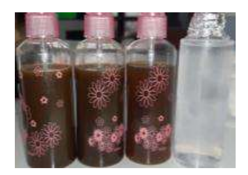
Figure 1. Aloe vera extract spray formulation results