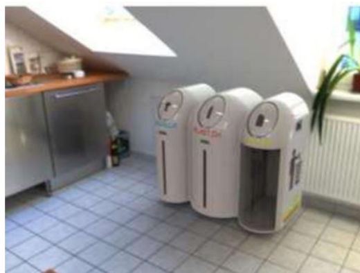
Fig. 2. Isometric design of trashcan

There are differences in the design of trashcan that are made with designs from previous studies. In some studies, the shape of the trash that is made in a box and no cover, trashcan is made from plastic and fiberglass [11]. The material used to make the trashcan from this research is plastic, while the wheels and the handle are made of steel and rubber. Most of the part of the trashcan is made of plastic. This is because plastic is affordable and easy to obtain. Design of the trashcan is found in. Figure 2, Figure 3 and Figure 4.