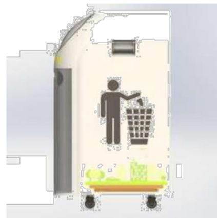
Fig. 4. Design of trashcan looks aside