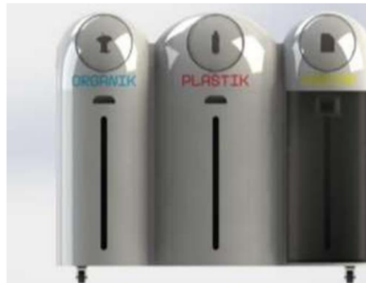
Fig. 3. Design of trashcan looks ahead