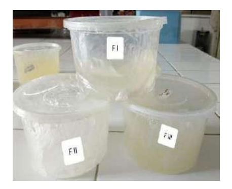
Figure 1. The free range chicken egg white gel preparation

semisolid with a distinctive odor of egg whites. The gel base (carrier) used was Carbopol, without the addition of egg whites. The result of gel making is showed at Figure 1.