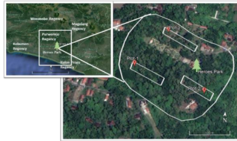
Figure 1. Map of sampling locations

Measurement of carbon stock and analysis of tree vegetation in Heroes Park was carried out on a plot measuring 20x100 m [20] in three plots randomly distributed over an area of 60,044 m 2 (Figure 1). The three plots with a total area of 0.6 ha or 6,000m 2 have been adapted to forest groups with an area of 1,000 hectares with a sampling intensity of ten percent [31].