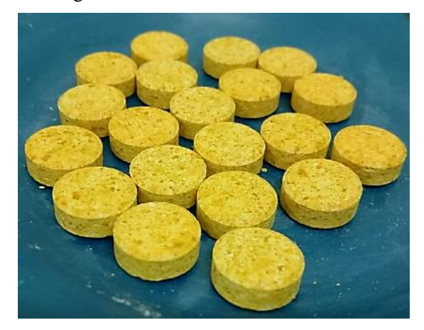
Fig. 3. Physical-coated tablets from the replication that meets the test standards

optimum result of SLD (R) is 0.542 from coating solution formulations of 0.25 and 0.75. Although this R-value is positive, the tests on hardness and disintegration time do not meet the standard requirements of the coated tablets. Moreover, the formulation has obtained a friability value of -0.663 %, a hardness value of 3.58 kg, and a disintegration time of 86.9 minutes. Physical-coated tablets after the replication are presented in Figure 3.