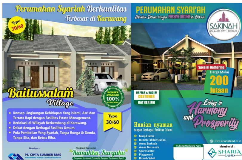
Image 3. Promotional posters.

Arabization and Islamization can also be observed in the lifestyle choices of Indonesian Muslims, particularly in the phenomenon of sharia' housing. Sharia' housing refers to a type of property whose conveyancing system is implemented in accordance with the sharia', particularly in the sense that the ownership scheme is run according to the precepts of Islam. These new Indonesian trends in business and Muslim lifestyles are expressed in a number of Arabic terms, targeting people in search of new alternatives in their choice of housing and/or properties in an environment which approaches Islamic norms as closely as possible (see Image 3).