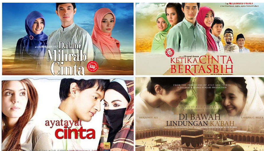
Image 5. Indonesian films containing Arabic words.