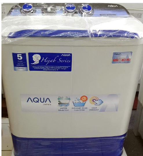
Image 1. The product of the Hijab Series washing machine.

for a hijab tends to be delicate and smooth – usually a type of chiffon or cheesecloth or a diaphanous scarf – and care must be taken in laundering it, let alone putting it in a machine with other dirty clothes. Interestingly, the marketing team have designed posters and organized campaigns distributed through online media which explicitly contain the word “ hijab series ” as part of their appeal (see Image 1). The marketing team has assured consumers that the Hijab Series washing machine will launder hijabs without fear of the fabric being damaged or causing discoloration, underlining that the machine is equipped with a pulsator designed to run at a certain speed to prevent fabric damage during the laundering process. The promotion of this device began in 2018 and it continues to be in demand among Indonesia’s Muslim community.