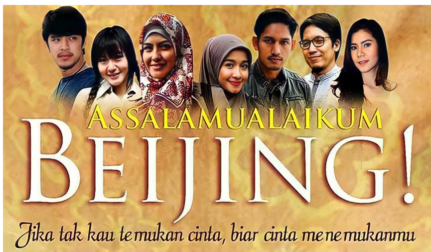
Image 6. Assalamualaikum Beijing . (Retrieved from: https://jadiberita.com/58958/film-assalamualaikum-beijing-ditayangkan-di-jepang.html ).