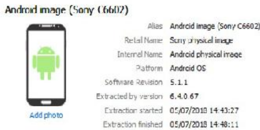
Fig. 4. Device Identification by Oxygen Forensic.

While in MOBILedit forensic the device identification result is as expected. Metadata from the device like serial number, IMEI, IMSI, ICCID, Root status. All of the important metadata can be revealed and documented as in Fig. 5. MOBILedit forensic is quite successful in identification mobiledit mobile device.