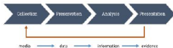
Fig. 1. Digital Forensic Process.

Every digital forensic method has different stages in each handling of the digital evidence found, so in the handling of various evidence, it requires different digital forensic models [10]. In many references, digital forensics process at least can be divided into four steps as in Fig. 1, collection, preservation, analysis, and presentation [11]. The naming four stage of digital forensic model is very flexible to be changed as needed for investigation. Sometimes at the end of the process called "reporting" instead of presentation and at the beginning begins with the identification process before collection/preservation.