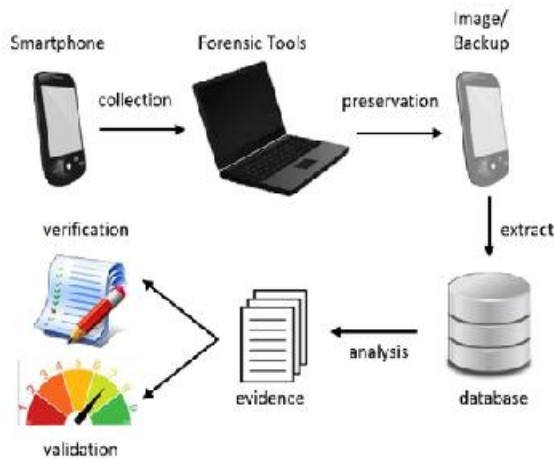
Fig. 2. A Brief Process of Forensic Tools Evaluation.

Six aspects above need for validation and verification for evaluating the tools. Validation technique used quantitative calculation so that assessment more objective, but to verify, the researcher simply apply quantitative assessment. Among the aspects that can be considered qualitatively are device identification, data extraction, case management and deleted data retrieval. While to messenger application analysis and data report can be assessed quantitatively in the term of the performance in producing the evidence.