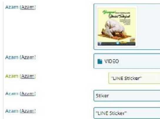
Fig. 9. LINE Messenger Analysis in MOBILedit Forensic.

While in MOBILedit forensic, analysis of messenger is presented in the report file with a colored block display like a message application look, as shown in Fig. 9.