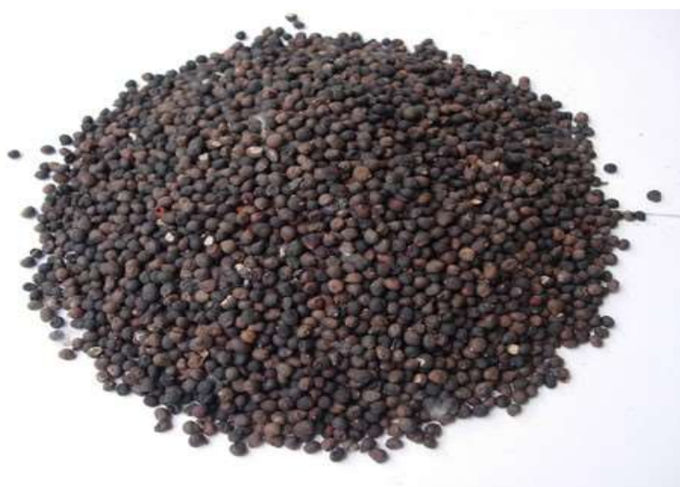
Figure 1 Kapok seed

kapok seed used researched are in figure 1 as follows: