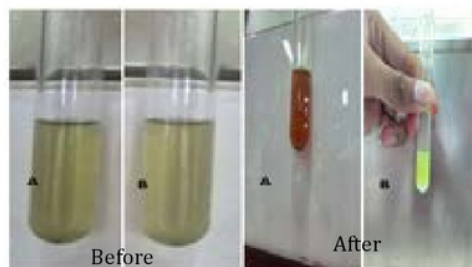
Figure 1 Identification of phytomelatonin in the ethanolic extract of Ulva lactuca L. (A) in Dragendrof reactant and (B) Mayer reactant

Obtained extract was preliminary identified to determine the prescence of alkaloid compound, because phytomelatonin was classified as alkaloids. Identification showed that reddish