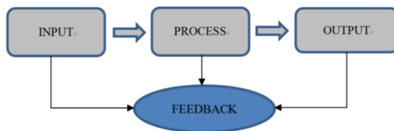
Figure 1. The framework of research.

This study investigated the implementation of Pneumonia case-finding program in children in Sleman district during January–December 2018. Input, Process and Output were used to evaluate the program (Figure 1). Input consists of human resource quality, facilities and infrastructure and funding. The process comprises of planning, implementation, monitoring and evaluation. The program output is case finding coverage.