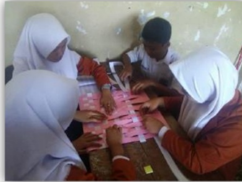
Figure 1. Students make the ornaments using manila paper

entitle "Activity 2" about the concept of rotation. Activities in the SW start from preparing the Anyaman and ornaments, as shown in Figure 1.