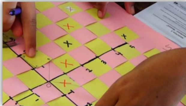
Figure 2. Students rotate the ornaments and calculate the coordinates (Informal)

At this stage, students do activities based on the steps or instructions on the SW entitle "Activity 2" which starts from preparing the woven and ornamentation. After all, students are ready with their weaving and ornaments, and the teacher instructs each group to record the initial coordinates and the final coordinates after they are rotated according to the instructions in the worksheet. In Figure 2, students are seen rotating the ornaments according to the instructions in SW "Activity 2" to get a starting point and endpoint.