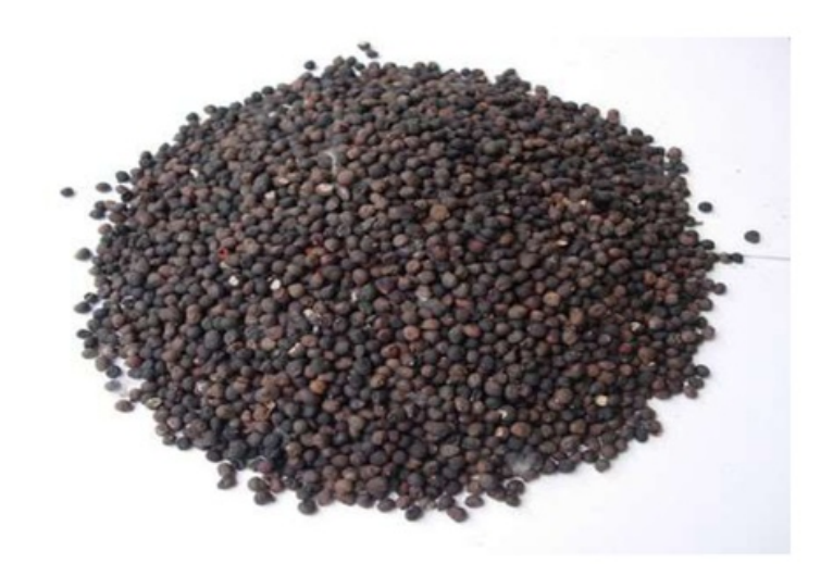
Figure 1 Kapok seed

kapuk seed used researched are in figure 1 as follows: