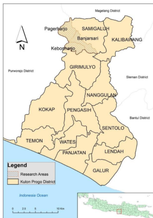
Fig. 2: Research Areas, which were consisted of 3 villages: Pagerharjo, Banjarsari and Kebonharjo, Samigaluh, Kulon Progo, Yogyakarta Province, Indonesia

A structured questionnaire, checklist, and Geographic Positioning System (GPS) were used to collect the data. A questionnaire was established by the researcher based on literature review then tested on 30 people who were not included in our sample with 0.675 Cronbach's Alpha. Questionnaire divided into two sections: First was general questions (Name, Sex, Age, Address, and Occupation). A second part was multiple choice questions related to malaria prevention such as habit in using a bed net, repellent, outdoor activity and other risk factors. Checklist was used as guidance when observed the existence of ventilation net, livestock cage, and for writing the coordinate the case and control. For every variable, participants divided into two categories (at risk and not risk) based on their answer.