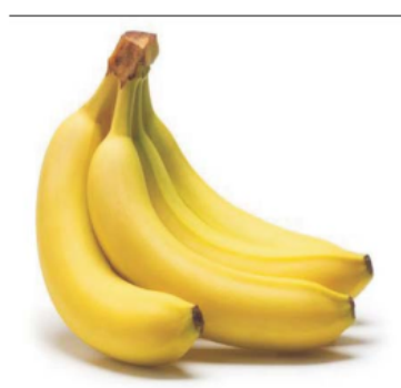
Figure 1. Ambon banana fruit

1 This study showed that there were no influence of pre-treatment and co-treatment of ambon banana fruit juice ( Musa paradisiaca L.) on the furosemide bioavailability.