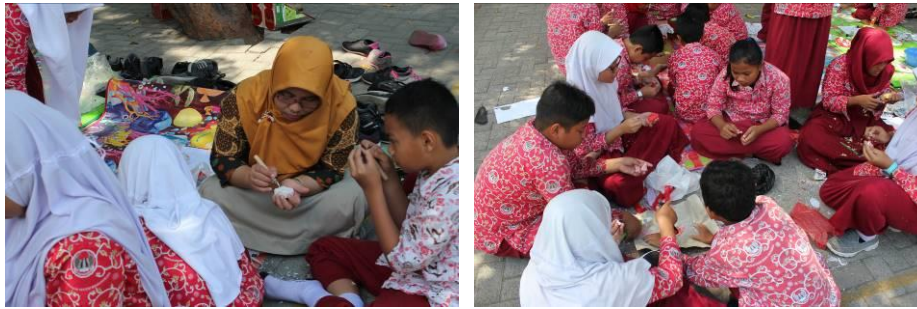
Fig. 2. Assistance in the Practice of Making Sculpture

Next activity, we are doing the exercise to make sculptures. We are also interacting with the students about the process and talking to each other if their friends can't finish the artwork. They can help their friends to fix sculpturing material. Figure 2 lecturer and tutor teacher assistance in the outing class.