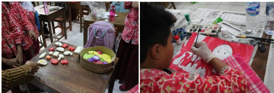
Fig. 3. The Sculpture and Process of Making Advertising

Figure 3 is talking about the artwork after finishing with carving techniques on to the bath soap (left). And the right figure, it is one of the students who captured by the photographer which making advertising with poster color and brush. They learned wet media for exploring techniques and ideas.