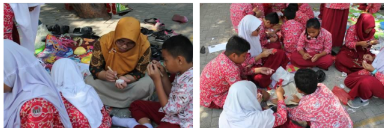
Fig. 2. Assistance in the Practice of Making Sculpture

1 Next activity, we are doing the exercise to make sculptures. We are also interacting with the students about the process and talking to each other if their friends can't finish the artwork. They can help their friends to fix sculpturing material. Figure 2 lecturer and tutor teacher assistance in the outing class.