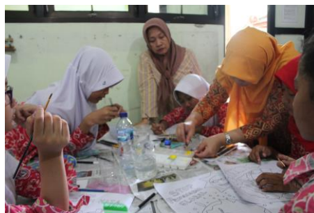
Fig. 4. Lecturer and Tutor Teacher Assistance

They are also trying to make gradation from three colors until seven color levels. Furthermore, learning activities can be described in more detail following aspects of a person, product, process, and the environment. Elementary students in 6th Grade are making sculptures, and advertising artworks have used more tools and materials. Every artwork has difficulty levels; the lecturer and tutor teacher are collaboration to solve. Figure 4 is about lecture and tutor teacher assistance for the students using poster color and mixing between primary color (red, blue, and yellow).