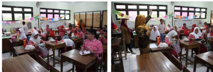
Fig. 1. Work Instruction and Preparing