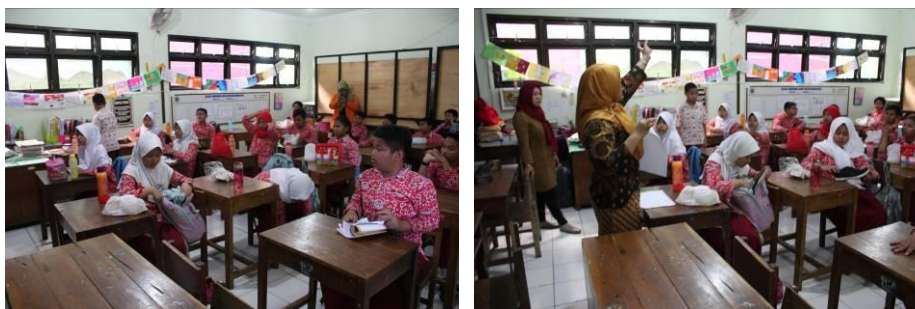
Fig. 1. Work Instruction and Preparing