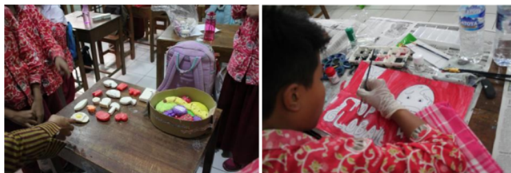
Fig. 3. The Sculpture and Process of Making Advertising

Figure 3 is talking about the artwork after finishing with carving techniques on to the bath soap (left). And the right figure, it is one of the students who captured by the photographer which making advertising with poster color and brush. They learned wet media for exploring techniques and ideas.