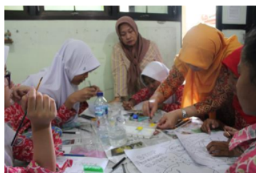
Fig. 4. Lecturer and Tutor Teacher Assistance

They are also trying to make gradation from three colors until seven color levels. Furthermore, learning activities can be described in more detail following aspects of a person, product, process, and the environment. Elementary students in 6th Grade are making sculptures, and advertising artworks have used more tools and materials. Every artwork has difficulty levels; the lecturer and tutor teacher are collaboration to solve. Figure 4 is about lecture and tutor teacher assistance for the students using poster color and mixing between primary color (red, blue, and yellow).