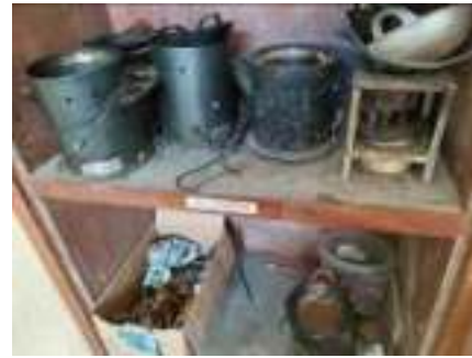
Fig. 9. The electric stove is used to heat the wax (wax) to make it liquid.