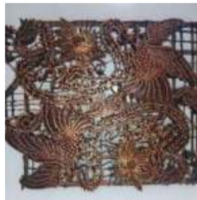
Fig. 4. Metallic Phaksi motif stamp tool.