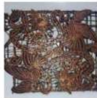
Fig. 4. Metallic Paksi motif stamp tool