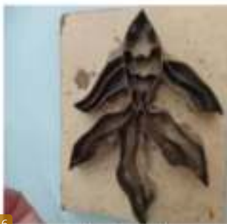
Fig. 15. Panna batik stamp tool made from duplex paper and hardboard cut.

Figure 13, Figure 14, and Figure 15 are examples of batik stamps and equipment to make them made from unused material or objects that are old and rarely used. Students become more able to imagine the concept of batik learning for