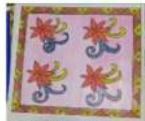
Fig. 17. The design motif of batik motif of flora motif with symmetrical balance and temporal decoration. (Source: Students artwork of PGSD Ahmad Dahlan University Fotografer: Vais Febrian, 2019)