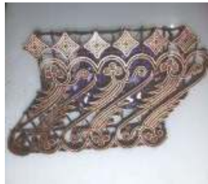
Fig. 3. Metallic Parang motif stamp tool