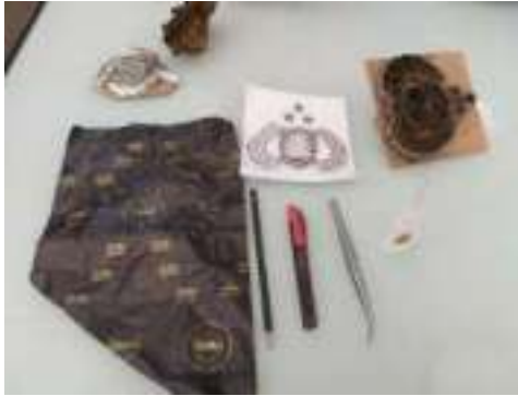
Fig. 13. Materials and tools used to make batik master stamp (carbon paper, HVS paper, 2B pencil, cutter, tweezers, hardboard cut, G glue, duplex/ Malaga paper.

(thinking) to defeat their previous feelings when seeing examples of images and videos about “batik cap” by after seeing a simple batik stamp tool. From a series of sense and thought, students can deduce their own aesthetic meaning (rationing) in the observed objects.