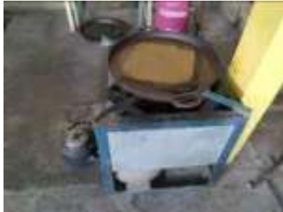
Fig. 6. Frying pan or pan to heat the " Malam " (wax) to taste. " Malam " that has been hot and melted at the top is given a burlap cloth and metal slab that serves as a place to filter dirt.