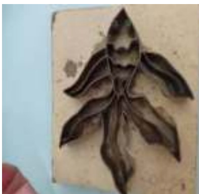
Fig. 15. Fauna batik stamp tool made from duplex paper and hardboard cut.

Figure 13, Figure 14, and Figure 15 are examples of batik stamps and equipment to make them made from unused material or objects that are old and rarely used. Students become more able to imagine the concept of batik learning for