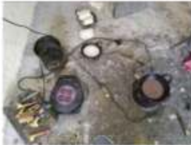
Fig. 12. A set of pans and Casting for batik.