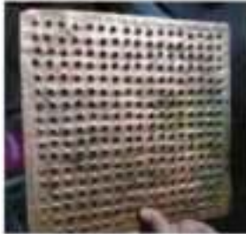
Fig. 7. A metal plate that functions as a filter for sight dirt (wax) that has been heated in a pan or pan. The size of the slab is adjusted to the diameter of the pan or pan.