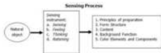
Fig. 1. Image Flowchart of Sensing Natural Objects into Artificial Objects [18]

[18] explains that aesthetic sensing is an objectification process of rationalized feelings that is learned as seen. The objectification process can be said to be an objectification experience including sensing (taste so that it becomes a priori), feeling (to [17] in thoughts that are still influenced by taste), thinking (process to overcome feelings that have taken place during objectification experiences), and rationing (aesthetic knowledge becomes knowledge the systemically is the relationship between the components of beauty with one another).