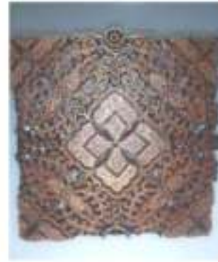
Fig. 2. Metallic Dora motif stamp tool

The material about batik stamp covers history, characteristics, coloring techniques, and finishing works. Students pay close attention to the material given by supporting lecturers, which contain definitions, various motifs, and techniques for making "batik cap." Next, students are asked to do an individual visual analysis of the pictures and videos that are presented by the lecturer. Students analyze photos and videos then give comments in writing. The results of the analysis were collected at the next meeting. The result is that from 40 people, ten samples were taken to find out the perception of stamped batik, the results of 2 people had the notion that stamped batik was a type of craft made using a metal stamp, and eight people were not familiar with this type of batik. This is because their thinking power is still low, along with the extraction of information that has been done. The pictures presented are presented as follows.