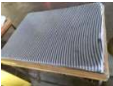
Fig. 8. A wettable that functions as a cloth base that is being stamped with a metal stamp. This table contains cold water that is stacked with a sponge and covered by a blanket cloth and covered by glass paper. The purpose of this table is made so that the process of tasting the fabric is not sticky because it is exposed to cold temperatures from glass paper.