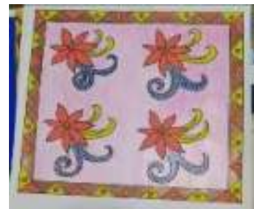
Fig. 17. The design motif of batik motif of flora motif with symmetrical balance and tumpal decoration.