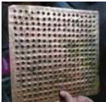
Fig. 7. A metal plate that functions as a filter for night dirt (wax) that has been heated in a pan or pan. The size of the slab is adjusted to the diameter of the pan or pan.