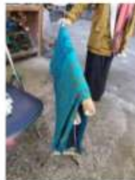
Fig. 11. "Gawangan" is a tool for laying fabric that is being processed batik, can be used as a place to dry batik cloth.