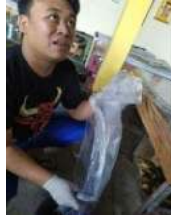
Fig. 10. Glasspaper is used to cover the surface of the blanket covering the wet sponge after being soaked in cold water on a wet table. How to use it, glass paper moistened with water and after bending, then covered on a wet sponge.