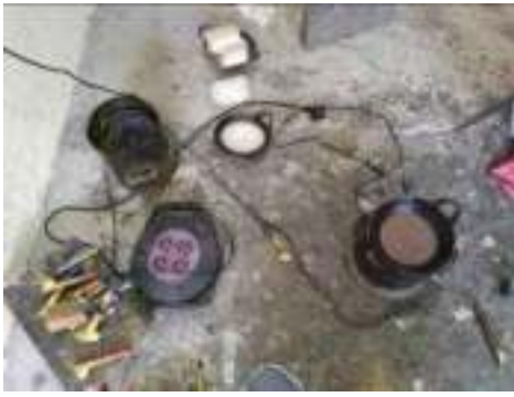
Fig. 12. A set of pans and Canthing for batik.