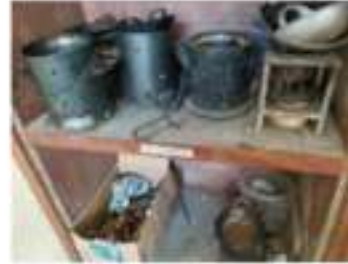
Fig. 9. The electric stove is used to heat the wax (wax) to make it liquid.