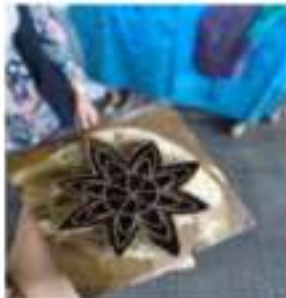
Fig. 14. Flora motif batik stamp tool made from used paper and food containers.