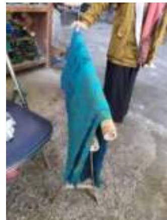
Fig. 11. " Gawangan " is a tool for laying fabric that is being processed batik, can be used as a place to dry batik cloth.