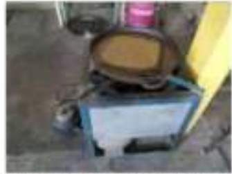
Fig. 6. Frying pan or pan to heat the "Malam" (wax) to taste. "Malam" that has been hot and melted at the top is given a burlap cloth and metal slab that serves as a place to filter dirt.