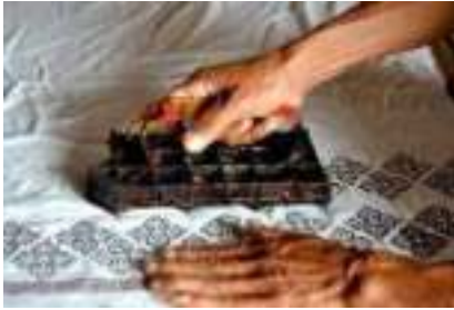
Fig. 5. The copying process on Mori is using melted wax. [21]