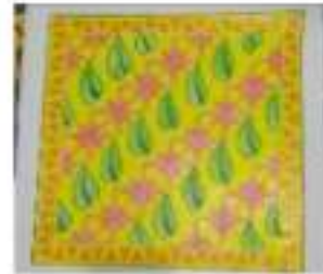
Fig. 16. Gold motif design of motif flora repetition model (Source: Students artwork of PGSD Ahmad Dahlan University, Fotografer: Vais Febrian, 2019)

Students began to apply the aesthetic objectification process of "batik cap" by making a "batik cap" motif design by considering the basic elements and principles of fine arts. Based on the stages in making stamped batik works and following selected data collection procedures, the following results can be obtained.