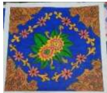
Fig. 18. Design batik motifs with flora motifs with symmetrical balance and tumpal decoration. (Sumber: Karya mahasiswa PGSD Universitas Ahmad Dahlan, Fotografer: Vais Febrian, 2019)