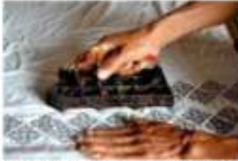
Fig. 5. The copying process on Mori is using melted wax. [21]