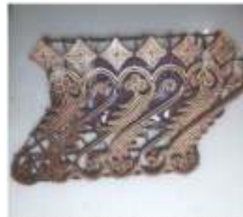
Fig. 3. Metallic Parang motif stamp tool