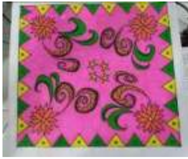
Fig. 19. Design batik motifs with flora motifs with symmetrical balance, tumpal decoration, and full color.

Figure 16, Figure 17, Figure 18, Figure 19 is a form of representation of the aesthetic objectification of the “batik cap” and the stamp tool as outlined in the design work of the motif in the two-dimensional plane. According to Pamadhi, making “batik cap” include the sensing process in visual art learning for elementary students. It uses an instrument like sensing, feeling, thinking, and rationing.