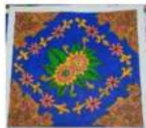
Fig. 18. Design batik motifs with flora motifs with symmetrical balance and temporal decoration.