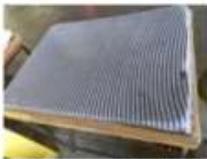
Fig. 8. A worktable that functions as a cloth base that is being stamped with a metal stamp. This table contains cold water that is stacked with a sponge and covered by a blanket cloth and covered by glass paper. The purpose of this table is made so that the process of tasting the fabric is not sticky because it is exposed to cold temperatures from glass paper.