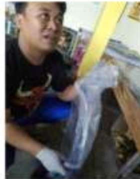
Fig. 10. Glasspaper is used to cover the surface of the blanket covering the wet sponge after being soaked in cold water on a wet table. How to use it, glass paper moistened with water and after bending, then covered on a wet sponge.