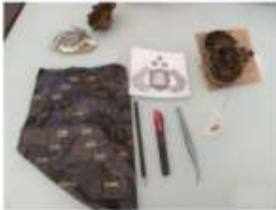
Fig. 13. Materials and tools used to make batik master stamp (carbon paper, HVS paper, 2B pencil, cutter, tweezers, hardboard cut, G glue, duplex/ Malaga paper.

(thinking) to defeat their previous feelings when seeing examples of images and videos about "batik cap" by after seeing a simple batik stamp tool. From a series of sense and thought, students can deduce their own aesthetic meaning (rationing) in the observed objects.