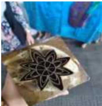
Fig. 14. Flora motif batik stamp tool made from used paper and food cartons.