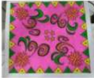
Fig. 19. Design batik motifs with flora motifs with symmetrical balance, triangular decoration, and full color.

Figure 16, Figure 17, Figure 18, Figure 19 is a form of representation of the aesthetic objectification of the "batik cap" and the stamp tool as outlined in the design work of the motif in the two-dimensional plane. According to Pamadhi, making "batik cap" include the sensing process in visual art learning for elementary students. It uses an instrument like sensing, feeling, thinking, and reasoning.