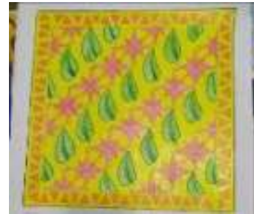
Fig. 16. Good motif design of motif flora repetition model

Students began to apply the aesthetic objectification process of “batik cap” by making a “batik cap” motif design by considering the basic elements and principles of fine arts. Based on the stages in making stamped batik works and following selected data collection procedures, the following results can be obtained.