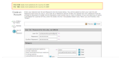
Screen Shot 2020-06-02 at 5.19.39 PM.png 92K