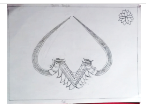
Figure 13. Picture of Dragon Motif (Gusnanda, 2020)