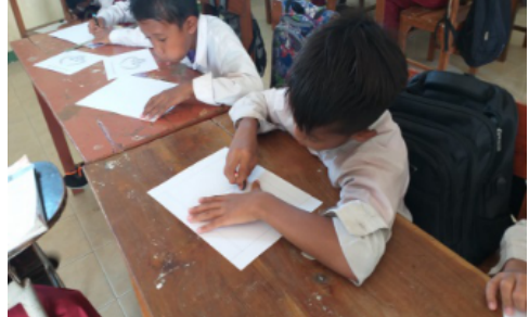
Figure 1. Sensing Objective Documentation

From the sense of objectification sensing discussed, the comparison also has an important role. Students compare the picture they make with the example given by teachers. Thus even the students feel much different; they believe that the images in the examples are not the work of human drawings but instead use existing technology. It is proven when there are friends who tell their peers (Figure 4).