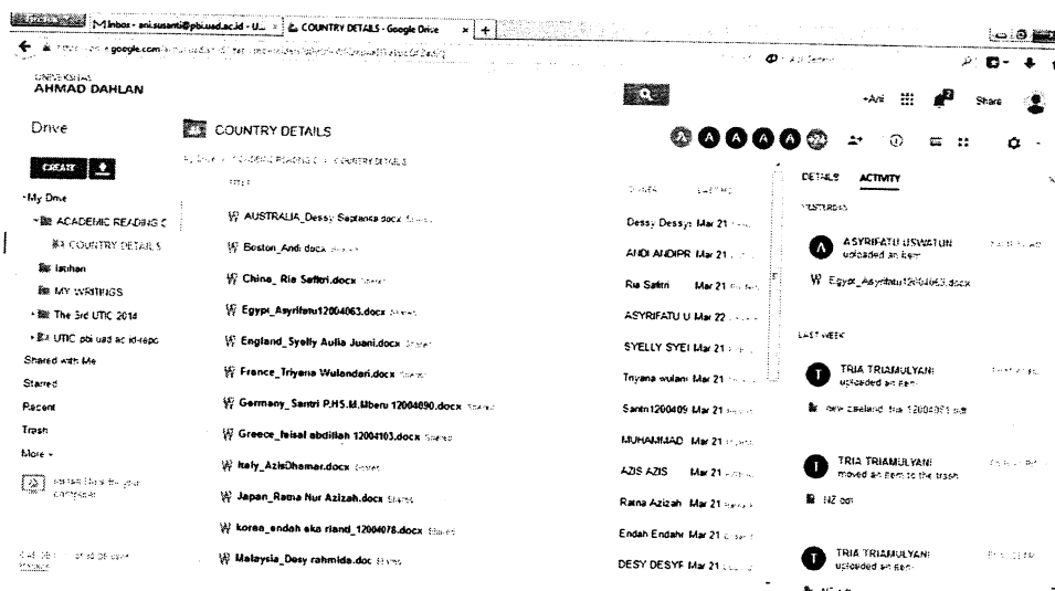
Figure 1. Country Details Folder Content

The students were encouraged to read their friends searching report and welcomed to comment through online room chat. By the time this paper was written, the students have not yet started to do chatting about this task.