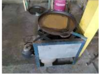
Fig. 6. Frying pan or pan to heat the " Malam " (wax) to taste. " Malam " that has been hot and melted at the top is given a burlap cloth and metal slab that serves as a place to filter dirt.