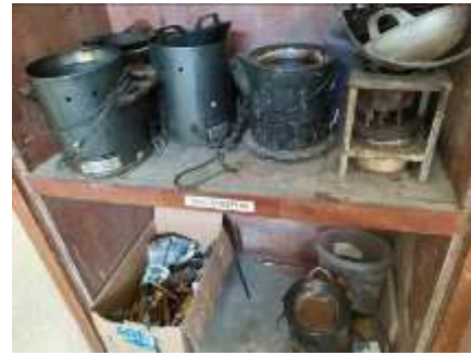
Fig. 9. The electric stove is used to heat the wax (wax) to make it liquid.