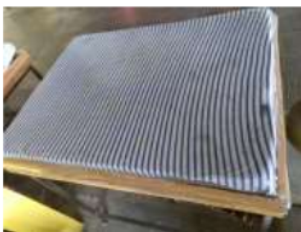
Fig. 8. A wettable that functions as a cloth base that is being stamped with a metal stamp. This table contains cold water that is stacked with a sponge and covered by a blanket cloth and covered by glass paper. The purpose of this table is made so that the process of tasting the fabric is not sticky because it is exposed to cold temperatures from glass paper.