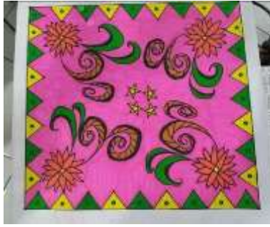
Fig. 19. Design batik motifs with flora motifs with symmetrical balance, tumpal decoration, and full color.

Figure 16, Figure 17, Figure 18, Figure 19 is a form of representation of the aesthetic objectification of the “batik cap” and the stamp tool as outlined in the design work of the motif in the two-dimensional plane. According to Pamadhi, making “batik cap” include the sensing process in visual art learning for elementary students. It uses an instrument like sensing, feeling, thinking, and rationing.