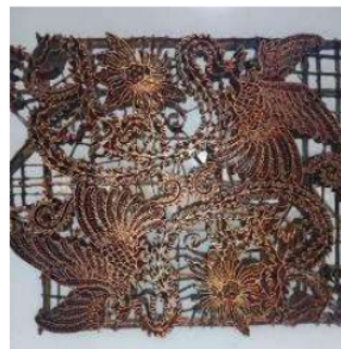
Fig. 4. Metallic Phaksi motif stamp tool.