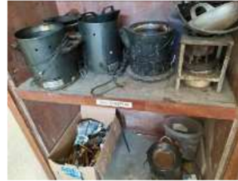
Fig. 9. The electric stove is used to heat the wax (wax) to make it liquid.