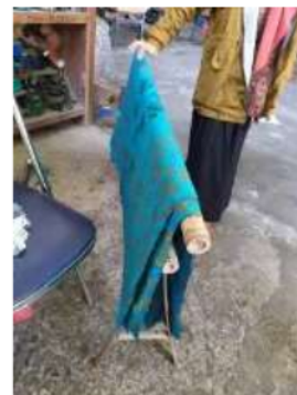
Fig. 11. " Gawangan " is a tool for laying fabric that is being processed batik, can be used as a place to dry batik cloth.