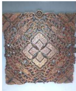
Fig. 2. Metallic flora motif stamp tool.

The material about batik stamp covers history, characteristics, coloring techniques, and finishing works. Students pay close attention to the material given by supporting lecturers, which contain definitions, various motifs, and techniques for making "batik cap." Next, students are asked to do an individual visual analysis of the pictures and videos that are presented by the lecturer. Students analyze photos and videos then give comments in writing. The results of the analysis were collected at the next meeting. The result is that from 40 people, ten samples were taken to find out the perception of stamped batik, the results of 2 people had the notion that stamped batik was a type of craft made using a metal stamp, and eight people were not familiar with this type of batik. This is because their thinking power is still low, along with the extraction of information that has been done. The pictures presented are presented as follows.