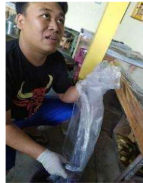
Fig. 10. Glasspaper is used to cover the surface of the blanket covering the wet sponge after being soaked in cold water on a wet table. How to use it, glass paper moistened with water and after bending, then covered on a wet sponge.