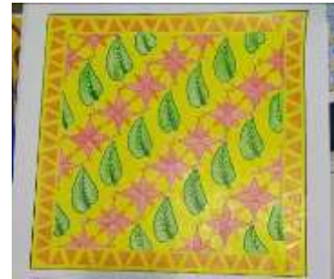
Fig. 16. Good motif design of motif flora repetition model

Students began to apply the aesthetic objectification process of “batik cap” by making a “batik cap” motif design by considering the basic elements and principles of fine arts. Based on the stages in making stamped batik works and following selected data collection procedures, the following results can be obtained.