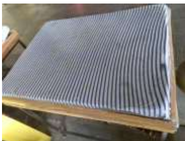
Fig. 8. A wettable that functions as a cloth base that is being stamped with a metal stamp. This table contains cold water that is stacked with a sponge and covered by a blanket cloth and covered by glass paper. The purpose of this table is made so that the process of tasting the fabric is not sticky because it is exposed to cold temperatures from glass paper. (Source: Studio of the Department of Textile at SMK Negeri 3 Kasihan, Bantul, Yogyakarta Photographer: Probosiwi, 2019)