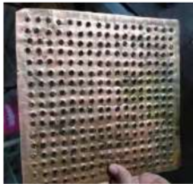
Fig. 7. A metal plate that functions as a filter for night dirt (wax) that has been heated in a pan or pan. The size of the slab is adjusted to the diameter of the pan or pan.