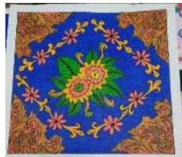
Fig. 18. Design batik motifs with flora motifs with symmetrical balance and tumpal decoration.