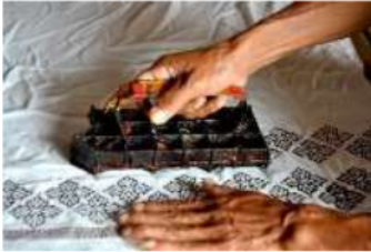
Fig. 5. The copying process on Mori is using melted wax. [21]