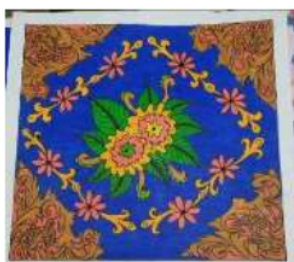
Fig. 18. Design batik motifs with flora motifs with symmetrical balance and tumpal decoration. (Sumber: Karya mahasiswa PGSD Universitas Ahmad Dahlan, Fotografer: Vais Febrian, 2019)