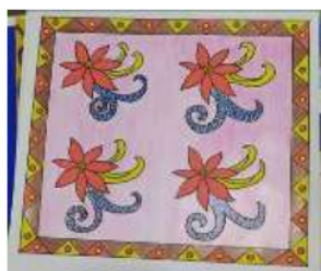
Fig. 17. The design motif of batik motif of flora motif with symmetrical balance and tumpal decoration. (Source: Students artwork of PGSD Ahmad Dahlan University Fotografer: Vais Febrian, 2019)