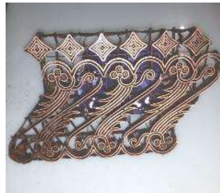
Fig. 3. Metallic Parang motif stamp tool