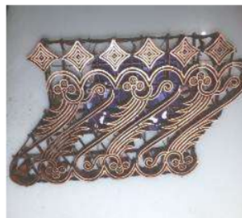
Fig. 3. Metallic Parang motif stamp tool