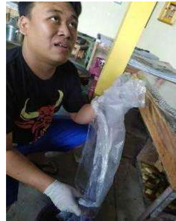
Fig. 10. Glasspaper is used to cover the surface of the blanket covering the wet sponge after being soaked in cold water on a wet table. How to use it, glass paper moistened with water and after bending, then covered on a wet sponge.