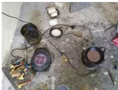
Fig. 12. A set of pans and Canthing for batik.