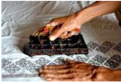
Fig. 5. The copying process on Mori is using melted wax. [21]