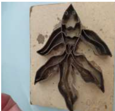
Fig. 15. Fauna batik stamp tool made from duplex paper and hardboard cut.

Figure 13, Figure 14, and Figure 15 are examples of batik stamps and equipment to make them made from unused material or objects that are old and rarely used. Students become more able to imagine the concept of batik learning for