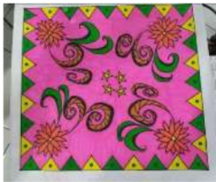
Fig. 19. Design batik motifs with flora motifs with symmetrical balance, tumpal decoration, and full color. (Sumber: Karya mahasiswa PGSD Universitas Ahmad Dahlan; Fotografer: Vais Febrian, 2019)

Figure 16, Figure 17, Figure 18, Figure 19 is a form of representation of the aesthetic objectification of the "batik cap" and the stamp tool as outlined in the design work of the motif in the two-dimensional plane. According to Pamadhi, making "batik cap" include the sensing process in visual art learning for elementary students. It uses an instrument like sensing, feeling, thinking, and rationing.