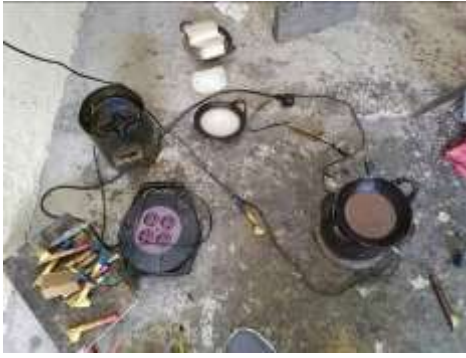
Fig. 12. A set of pans and Canthing for batik.