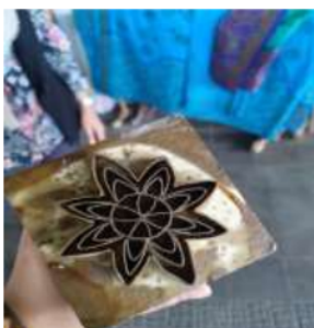
Fig. 14. Flora motif batik stamp tool made from used paper and food cartons.