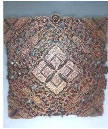
Fig. 2. Metallic flora motif stamp tool.

The material about batik stamp covers history, characteristics, coloring techniques, and finishing works. Students pay close attention to the material given by supporting lecturers, which contain definitions, various motifs, and techniques for making "batik cap." Next, students are asked to do an individual visual analysis of the pictures and videos that are presented by the lecturer. Students analyze photos and videos then give comments in writing. The results of the analysis were collected at the next meeting. The result is that from 40 people, ten samples were taken to find out the perception of stamped batik, the results of 2 people had the notion that stamped batik was a type of craft made using a metal stamp, and eight people were not familiar with this type of batik. This is because their thinking power is still low, along with the extraction of information that has been done. The pictures presented are presented as follows.