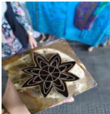
Fig. 14. Flora motif batik stamp tool made from used paper and food cartons.