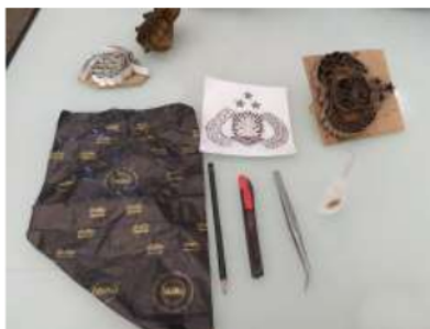
Fig. 13. Materials and tools used to make batik master stamp (carbon paper, HVS paper, 2B pencil, cutter, tweezers, hardboard cut, G glue, duplex/ Malaga paper.

(thinking) to defeat their previous feelings when seeing examples of images and videos about “batik cap” by after seeing a simple batik stamp tool. From a series of sense and thought, students can deduce their own aesthetic meaning (rationing) in the observed objects.