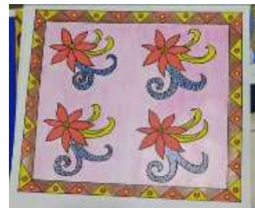
Fig. 17. The design motif of batik motif of flora motif with symmetrical balance and tumpal decoration. (Source: Students artwork of PGSD Ahmad Dahlan University Fotografer: Vais Febrian, 2019)