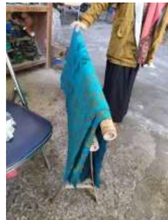
Fig. 11. "Gawangan" is a tool for laying fabric that is being processed batik, can be used as a place to dry batik cloth.