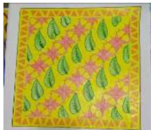
Fig. 16. Good motif design of motif flora repetition model (Source: Students artwork of PGSD Ahmad Dahlan University; Fotografer: Vais Febrian, 2019)

Students began to apply the aesthetic objectification process of “batik cap” by making a “batik cap” motif design by considering the basic elements and principles of fine arts. Based on the stages in making stamped batik works and following selected data collection procedures, the following results can be obtained.