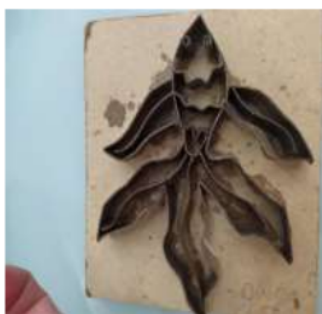
Fig. 15. Fauna batik stamp tool made from duplex paper and hardboard cut.

Figure 13, Figure 14, and Figure 15 are examples of batik stamps and equipment to make them made from unused material or objects that are old and rarely used. Students become more able to imagine the concept of batik learning for