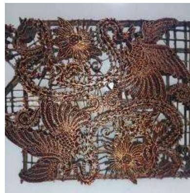
Fig. 4. Metallic Phaksi motif stamp tool.