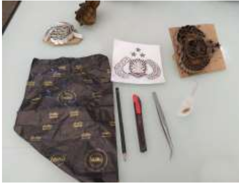
Fig. 13. Materials and tools used to make batik master stamp (carbon paper, HVS paper, 2B pencil, cutter, tweezers, hardboard cut, G glue, duplex/ Malaga paper.

(thinking) to defeat their previous feelings when seeing examples of images and videos about “batik cap” by after seeing a simple batik stamp tool. From a series of sense and thought, students can deduce their own aesthetic meaning (rationing) in the observed objects.