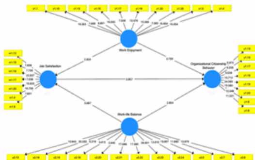
Figure 7. Output Inner Model

The bootstrapping stage explains that the variables that have a direct influence on OCB are job satisfaction, work enjoyment, and work-life balance. The following is the model after modification.