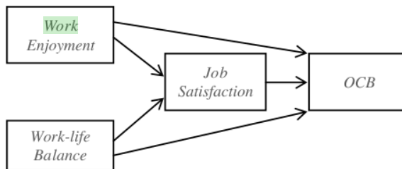
Figure 6. Work enjoyment and Work-life balance to OCB with Job satisfaction as Mediator

Based on the explanation above, the relationship between all variables to be examined in this study can be figured as follow: