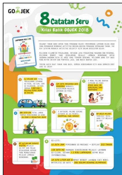
Fig. 1. The variety of Go-Jek services [8]

Gojek's journey began in 2010 as a motorcycle ride-hailing call center in Indonesia. The homegrown app was then launched in 2015 with only three services: GoRide, GoSend, and GoMart. Since then, the app has evolved into a Super App, a multi-services platform with more than 20 services today. Gojek is now a leading technology group of platforms serving millions of users in Southeast Asia [6]. Go-Jek Indonesia is one of the companies that are on the rise in Indonesia. It is a mobile application provider that offers a full range of services ranging from transportation, logistics, payment services, and other services. Go-Jek develops various innovations in its services as a solution and convenience in dealing with the problems of today's society. Services offered in the Go-Jek application include Go-Ride, Go-Car, Go-Food, Go-Credit, Go-Send Go-Point, Go-Bills, Go-Box, Go-Shop, Go-Mart, Go-Tix, Go-Med, and Go-Pay. Among the many services provided by Go-Jek, Go food is one of the most widely used by users. From the data released by Go-Jek, in 2018, more than 500 million have been successfully delivered by Go-Jek through the Go Foodservice [7]. Figure 1 is a variety of Go-Jek services.