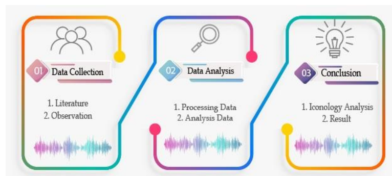
Fig. 3. Research Flow

Data analysis was performed by describing all data that had been obtained. The stages of the study followed the procedure, starting from observation, data processing, and data analysis. The analysis process ends with presenting conclusions. See Figure 3.