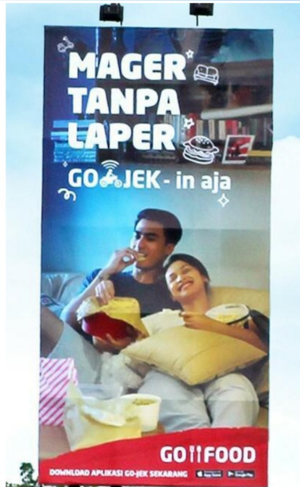
Figure 2. Ads. Design Billboard Go-Jek "Mager Tanpa Laper"