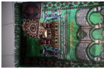
Figure 3. Religion

This image represents them apart from having to carry out their daily activities, and being preoccupied with their many assignments and also not forgetting to always worship Allah SWT. Because of all the sadness, fatigue and also fatigue after doing the business of the day, just by worshipping will get calm and also peace. In fact, sometimes the answers to all the difficulties of our life will be found by doing worship. Like the comments they have put forward.