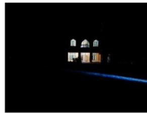
Figure 4. Mosque

PN informed, through Figure 4, that he needed to worship Allah. this sincere