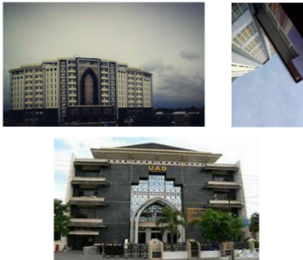
Figure 1. Building

Three main themes were found from the students' pictures. Several building pictures as places to learn and gaining support see figure 1, learning activities see figure 2 the prayer mat, and leisure. These places were comfortable places for them to study and seek knowledge see figure 1, with the support of modern facilities