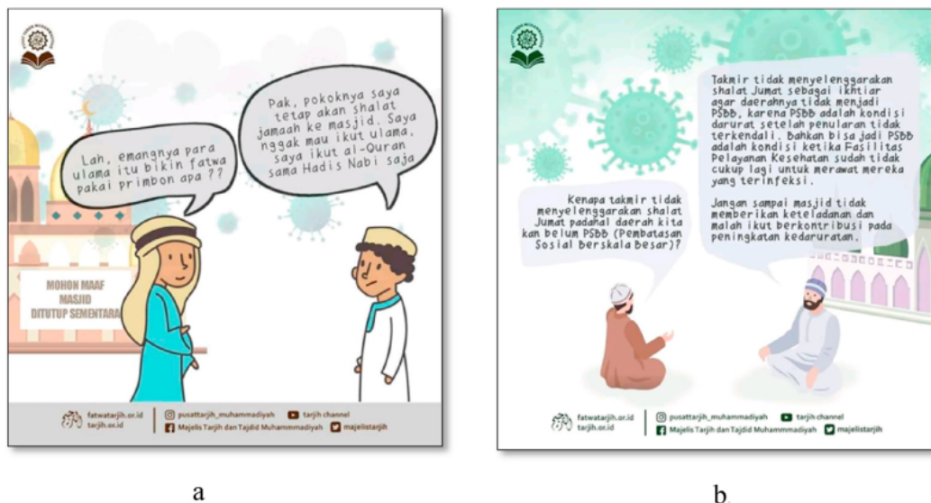
Fig. 3. (a) obeying religious provision by not going to the mosque during pandemics, (b) education about the possibility of changing jumah prayer with zuhur.