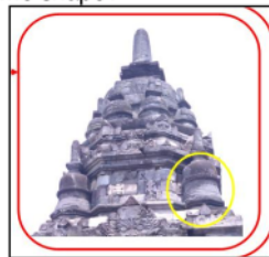
Fig 1. Stupa in Temple