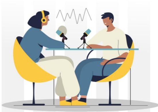
Figure 1. Media Podcast yang Interaktif

School counsellors' podcasts in consultation services can convey messages and various content through broadcasts or face-to-face (Ridha, 2021). Podcasts are indirectly in audio and video that others can listen to (Laila, 2021). Podcast variations and innovations in consulting services are relevant and meaningful to students or counselees. Individuals with academic stress problems can listen and analyze the content of messages directly from podcast media. If they meet face-to-face with counsellors, they can practice skills in preventing academic stress. As shown in Figure 1, podcasts are interactive media that support consulting services by professional counsellors.