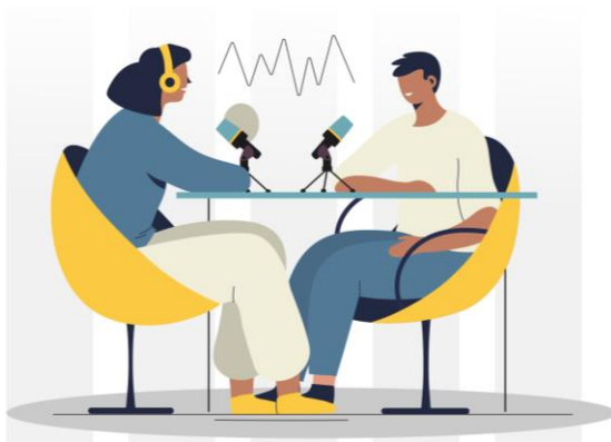
Figure 1. Media Podcast yang Interaktif

School counsellors' podcasts in consultation services can convey messages and various content through broadcasts or face-to-face (Ridha, 2021). Podcasts are indirectly in audio and video that others can listen to (Laila, 2021). Podcast variations and innovations in consulting services are relevant and meaningful to students or counselees. Individuals with academic stress problems can listen and analyze the content of messages directly from podcast media. If they meet face-to-face with counsellors, they can practice skills in preventing academic stress. As shown in Figure 1, podcasts are interactive media that support consulting services by professional counsellors.