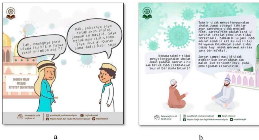
Fig. 3. (a) obeying religious provision by not going to the mosque during pandemics, (b) education about the possibility of changing jummah prayer with zuhur.