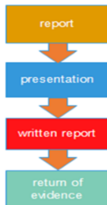
Figure 5. Reporting Process

The final result of an analysis process is a report. Reports from an analysis can be in the form of written reports needed as reports for documentation or oral reports in the form of presentations. The reporting process is explained in a groove like Figure 5.