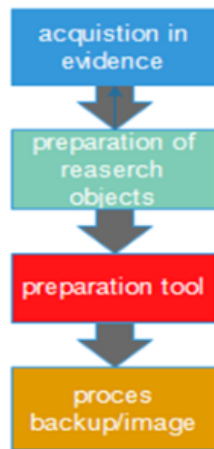
Figure 2. Collection process