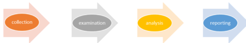
Figure 1. The NIST method for mobile forensic stages

Digital forensic aims to analyze and reconstruct an event related to a computer or digital artifact [17]. Digital forensic methods and processes have been developed 7 forensic investigators and practitioners [18]. This study applies a method for the National Institute of Standards and Technology (NIST) which is a forensic method for analyzing digital evidence on a smartphone media [19]. The flow of the NIST method as shown in Figure 1.