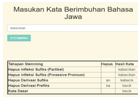
Figure 6. Stemming Result Page

The result of system implementation is as shown in the following Figure 6. The stemming result page shows the stemming process by using Nazief and Adriani algorithm and the root word as the result of the affixed Javanese word inputted.