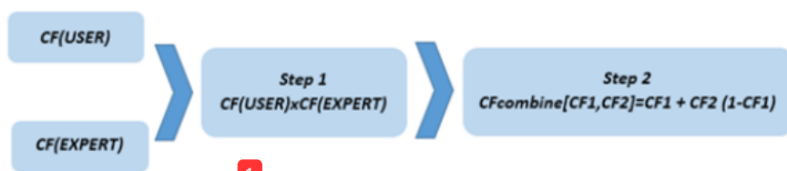
1 Figure 1. The step of the of method

Certainty Factor (CF) method is a method used to accommodate the inexact reasoning of an expert. An expert (such as a doctor) often analyzes the information available with an expression with uncertainty, to accommodate this we use CF to describe the level of expert confidence in the problem at hands[12]. In expressing the degree of certainty, CF assumes the degree of certainty of an expert on a data [2]. The following is a description of some combinations of Certainty Factor for various conditions [2, 13-15]: