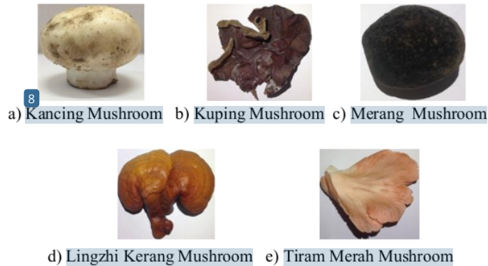
Figure 1. Image of mushroom Identification

Entropy [4]. The use of technology is so great that computers can work by mimicking the workings of the human brain by utilizing artificial neural network methods [5]. Classification technique used by Artificial Neural Networks with Backpropagation Algorithm. Artificial Neural Networks trains the network to get a balance between the ability of the network to recognize patterns used during training and the ability to respond correctly to input patterns similar to the patterns used during training [6]. As for this study, the type of fungus that will be identified is Kancing Mushroom, Kuping Mushroom, Merang Mushroom, Lingzhi Kerang Mushroom, and Tiram Merah Mushroom.