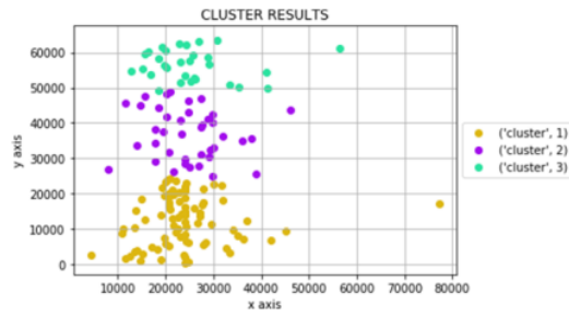
Fig. 2. Results of 3 clusters.