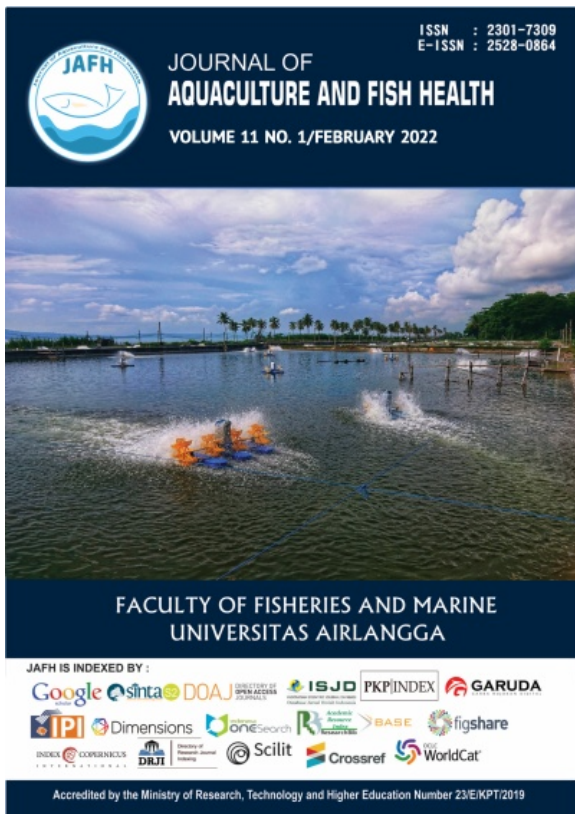
JAFH Vol. 11 No. 1 February 2022