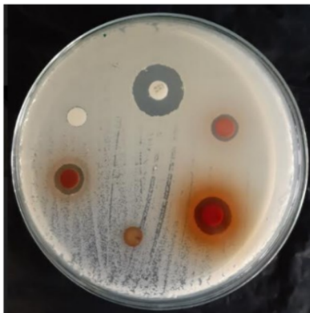
Figure 2. Screening of the active fraction; (a) ethanol extract, (b) n -hexane fraction, (c) ethyl acetate fraction, (d) methanol fraction, (e) positive control (Vancomycin 30 µg) and (f) negative control.

In the results of this study, the antibacterial activity of the extract and fractions were observed due to their phenolic content. The difference in the total phenolic of each sample affected the resulting zone of inhibition. This was proved by the finding that the higher the total phenolic content, the higher the zone inhibition diameter of Staphylococcus aureus ATCC 25923. The phenolic compounds will inhibit the growth of Gram-positive bacteria because of their ability to penetrate the bacterial cell walls (Purwantiningsih et al. , 2014). Phenolic compounds reduce the permeability of the bacterial cell wall by destroying cell membranes, activating enzymes, and denaturing cell membrane proteins. Changes in the permeability of the cytoplasmic membrane can cause the transport of important organic ions into the cell to be disturbed. This will inhibit growth and even cause cell death. Studies have shown that high concentrations of phenolic compounds will penetrate and disrupt bacterial cell walls (Purwantiningsih et al. , 2014).