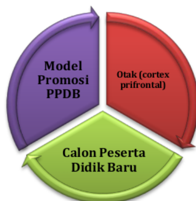
Figure 4. 3 Dimensional Concept of Neuroscience Promotion Model.

students even higher during this pandemic (Makin, 2018). Therefore, SMK Muhammadiyah 3 Yogyakarta continues to improve its creativity in conducting promotions in 2021. The promotion model used by the school is a promotion model with a neuroscience approach in psychosocial aspects. The concept of this promotion can be seen in Figure 4.