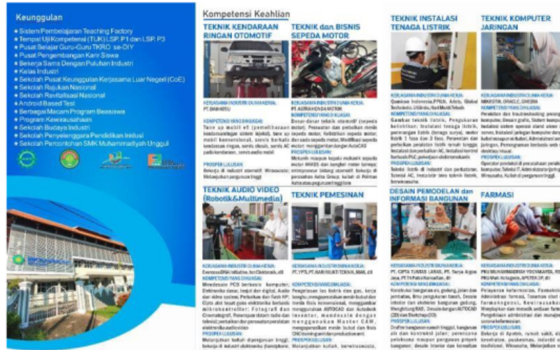
Figure 2. Brochure (Back View) Admission of New Students during the COVID-19 Period (Waka Humas, 2021).

In addition, the PR team also distributed brochures to SMP or MTs offline and online, both public and private. Besides distributing leaflets, the team also held virtual and online presentations (Tim Promosi PPDB, 2021). Usually, schools distribute and provide brochures to schools that have collaborated with SMK Muhammadiyah 3 Yogyakarta, as evidenced by the signing of the MoU. It is generally carried out as a facility to attract sympathizers of prospective new students. One of the schools that cooperates with SMK Muhammadiyah 3 Yogyakarta is SMP Muhammadiyah 7 Yogyakarta (Kepala Sekolah, 2021).