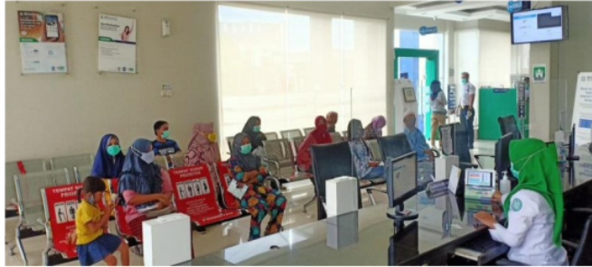
Figure 1. Frontliner Staff Direct Communication.

Figure 1 above is a direct communication by the BPJS Kesehatan Solok branch in providing information or handling participant complaints. Participants can request information or submit complaints by waiting for the queue to be handled by the frontline staff.