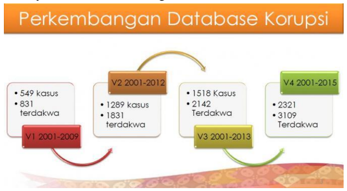
Figure 1. Corruption Database Development

The existence of the KPK has shown how "luxurious" the world of politics so that it "surprised" various groups and the general public. Data from the study of the Faculty of Economics and Business, Gadjah Mada University, shows the following.