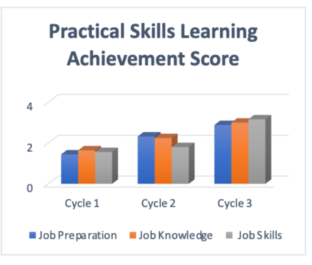
Figure 3. Improving practice learning achievement

Application of learning model explicit instructions can be implemented well by