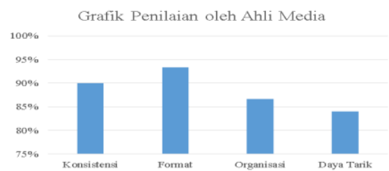
Fig. 4: Media Expert Validation Scores

The construct validity test was used to ascertain the differences in students' problem-solving skills prior to and after the module's implementation. The paired sample t-test results are presented in Table 1.