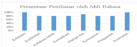
Fig. 3: Linguist Validation Scores

Stand-alone, Adaptive, and User-Friendly is adequate (mean score = 74, ideal percentage of 77.8%). Figure 2 illustrates the score for each aspect.