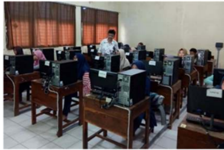
Figure 2. Graphic design, extracurricular learning activities.

Graphic design extracurricular activities are held on holidays, ie, every Saturday. This learning was carried out in collaboration with LK Aditama LKP. Learning is held 12 times and ends with a competency exam. Students who pass the competency test get a certificate issued by the LKP. The certificate can be used for conditions to find a job. This extracurricular activity is carried out, as shown in Figure 2.