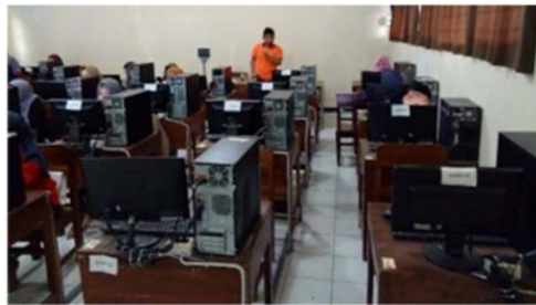
Figure 3. Graphic design, extracurricular learning activities.

Accounting computer extracurricular activities are held on holidays, ie, every Saturday. This learning was carried out in collaboration with LK Aditama LKP. Learning is held 12 times and ends with a competency exam. Students who pass the competency test get a certificate issued by the LKP. The certificate can be used for conditions to find a job. This extracurricular activity is carried out, as shown in Figure 3.