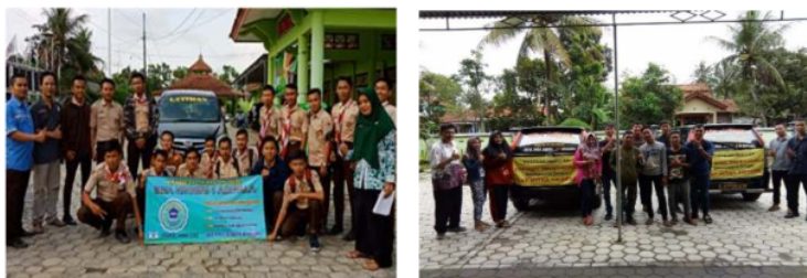
Figure 1. The steering wheel extracurricular learning activities.

Extracurricular learning on the steering wheel is held every Saturday when students are off school. This learning works with the Institute for Training and Skills. This activity was funded by the School Operational Assistance (BOS) fund and with the Education Operational Assistance (BOP) fund from the Central Java Provincial Government. This learning activity can be seen in Figure 1.