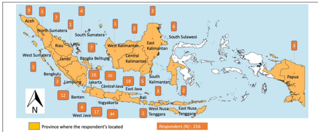
Figure 1. Distribution of respondents by province reside.

18 years or older were recruited using a google form distributed through several social media platforms, including Facebook, Instagram, Twitter, and WhatsApp. This also referred to our previous research that all mentioned platforms were favorite social media during the COVID-19 pandemic. 34 Recruitment was based on convenience and snowball sampling to ensure that our survey reached a large population. A total of 259 people responded to our survey, three of which we excluded because they stated under 18 years of age. Informed consent had appeared on the first page of the online questionnaire and continued with screening to the respondent before they took the survey by giving them some questions related to the eligibility (1) people who reside in Indonesian during the second impose of COVID-19 social restriction, (2) people aged at least 18 years old while taking the survey. Accordingly, as many as 256 valid responses were included in the analysis.