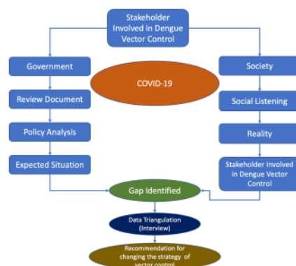
Figure 2 The developed framework used during the research.

center and health office, who was responsible for vector control in society and bridged communication to the health office related to proper dengue intervention in a particular area.