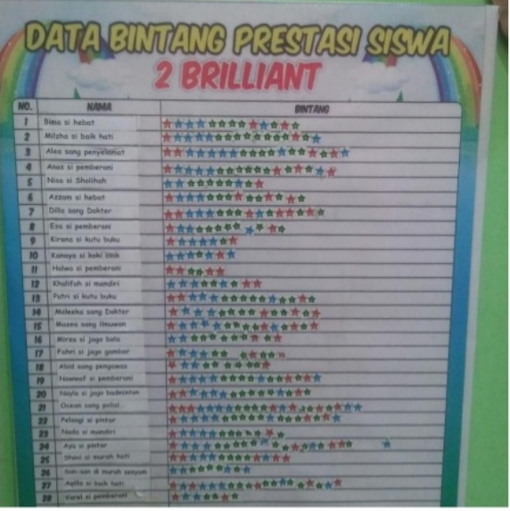
Figure 1. The Board of Star Award for Students

The examples of reinforcement that are used are by making starboard of achievement, as shown in Figure 1, this becomes an appreciation of good behavior that has been done by the students.