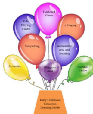
Figure 2. Child's Learning Media