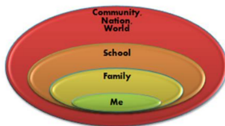
Figure 1. The Circle of Ideas

Writing can be understood as the attempt to communicate, plan, think, imagine, remember, collect and access information, or store ideas in memory (Moore-Hart, 2010). By doing writing, an author will represent and reclaim their experiences through their writing for the readers. The writing activity will be easier and naturally when students start to write by drawing and writing. Even, writing will emerge more easily when the students will write their experiences. Additionally, students will become more interested in the writing when they are facilitated to write centered around themselves. Here is the visualization of the circle of ideas in writing activities.