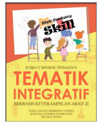
Fig. 1. Product Cover

The cover is designed by customizing the theme and sub-theme. The theme chosen was the 2nd theme, Always Save Energy, and the 3rd sub-theme was Alternative Energy for 4th-grade students. Figure 1 shows an example of a developed SSP cover.